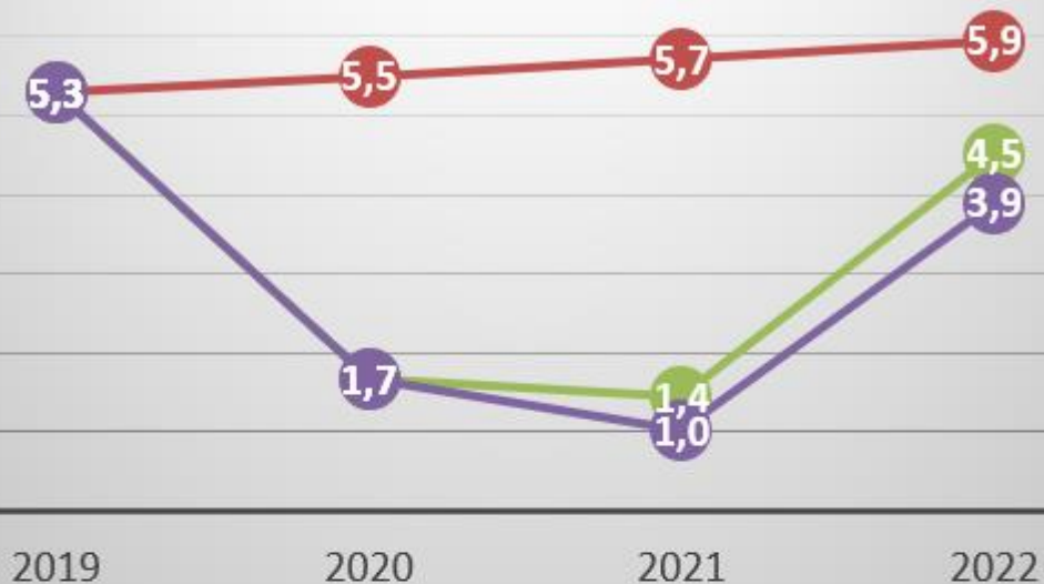
Domestic tourism demand, billion EUR