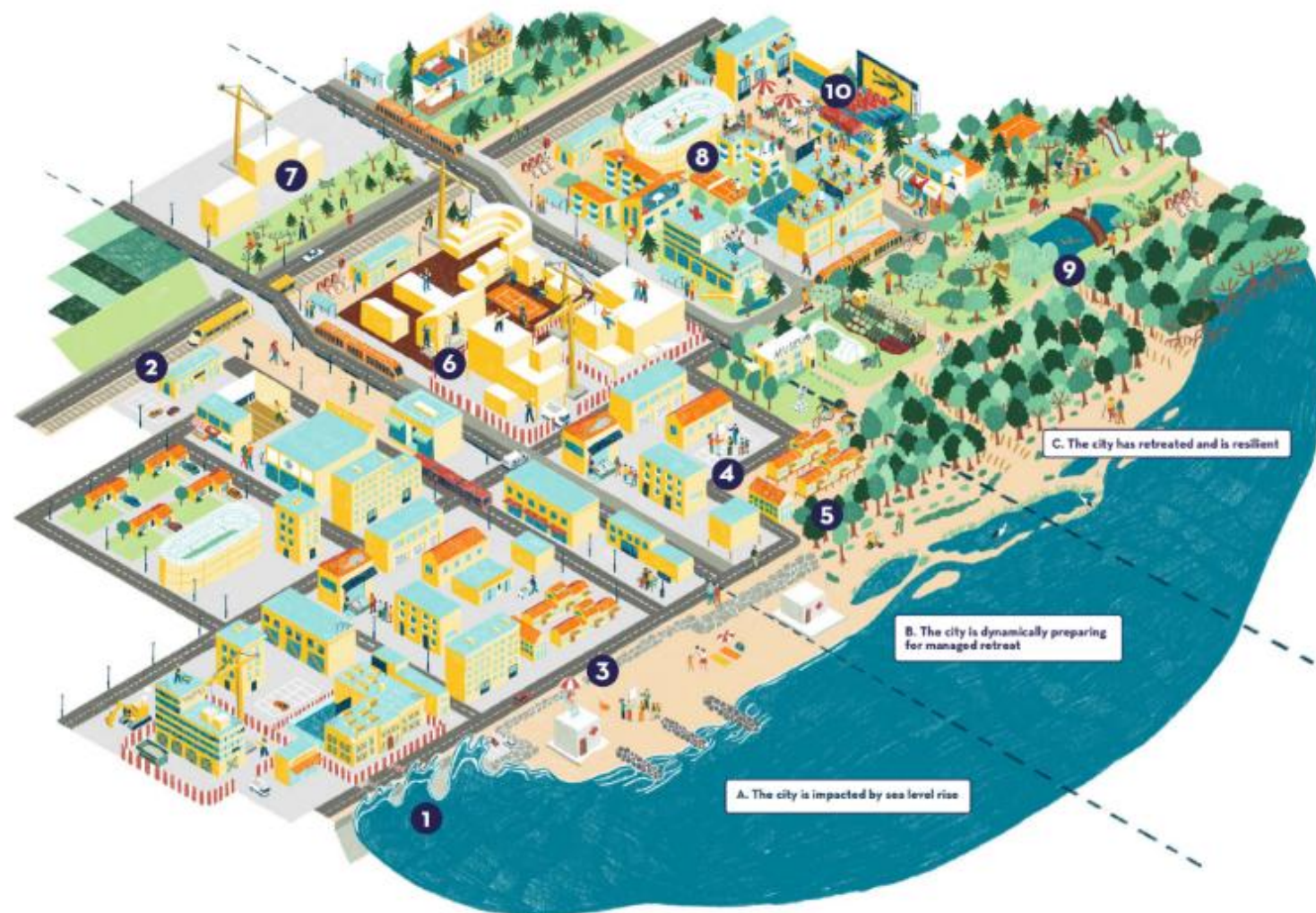
Illustration of a dynamic pathway to managed retreat