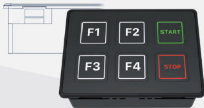
Variant TF3 Push buttons with front foil

Because of flexible design options, the insert symbols can be customized and glued in easily. This customization option makes the TF1 the perfect solution when it comes to tailor-made operating concepts.