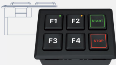
Variant TF2 Push buttons with predefined symbols