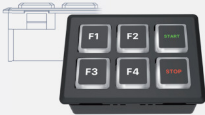
Variant TF1 Push buttons with insert symbols