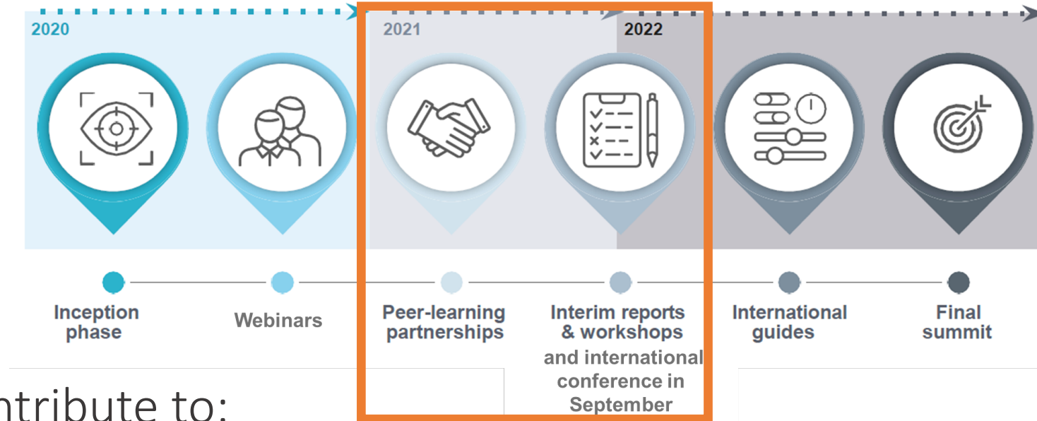
Timeline for the OECD GA implementation

Findings from the PLPs will contribute to: