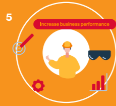
Exhibit your solution at BE 4.0 Mulhouse or accelerate your new idea for 6 months at Switzerland Innovation Park Basel Area – site Jura